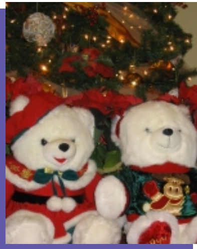
To everyone who donated Christmas gifts, we give a special "thanks." "Your contributions made a big difference!"