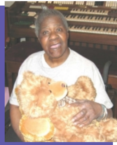
Lincoln Crawford resident welcomes her new roommate.